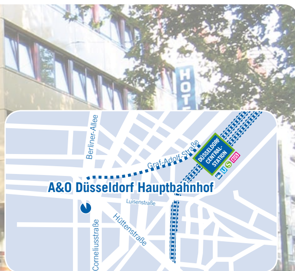
A&O Düsseldorf Hauptbahnhof, Corneliusstraße 9, D-40215 D'orf