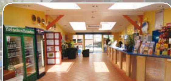
Entrance / Reception